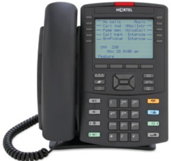
Nortel IP Phone 1230